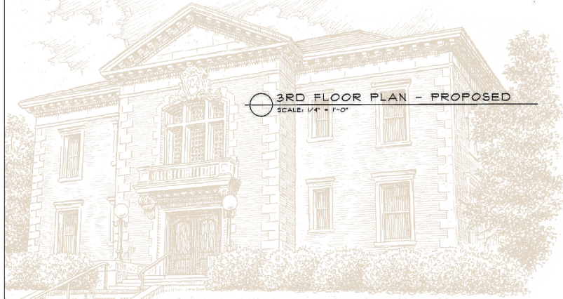
3RD FLOOR PLAN - PROPOSED SCALE: 1/4" = 1'-0"